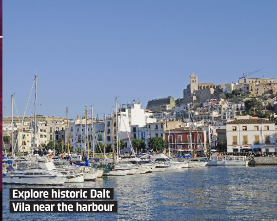
Explore historic Dalt Vila near the harbour