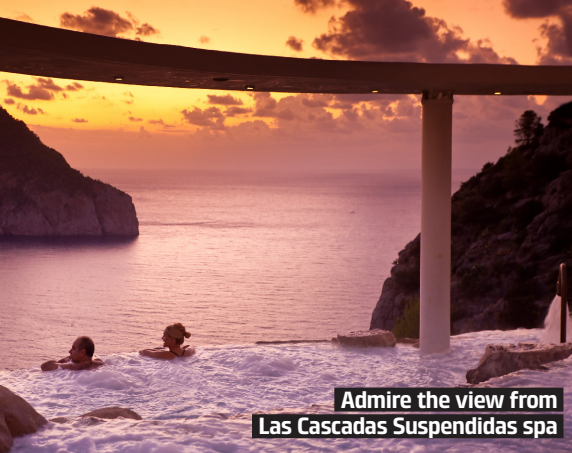
Admire the view from Las Cascadas Suspendidas spa