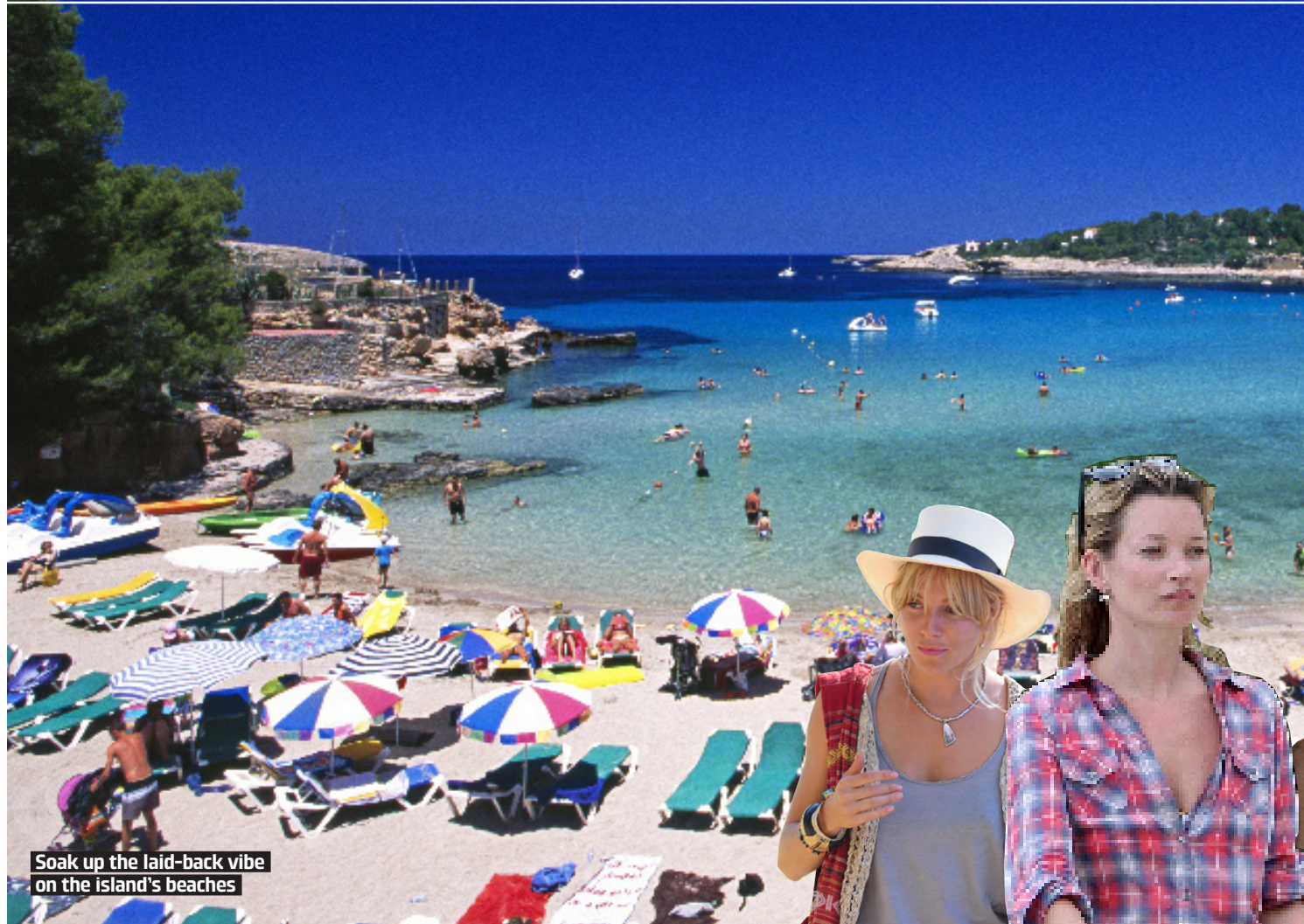
Soak up the laid-back vibe on the island's beaches

W hether you want to party all night at some of the world's best clubs, laze around on a glorious beach or get tanned and toned doing yoga, Ibiza really does have it all.