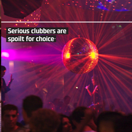
Serious clubbers are spoilt for choice